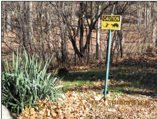
Wildlife crossing sign

In early summer CCC members posted yellow signs near the town's wetlands, bringing drivers' awareness to warm weather wildlife crossings. Our unscientific poll indicates they may have had a positive effect on the number of critter fatalities in these areas. The Commission thanks Candia drivers for their vigilance. We also wish to thank the volunteer "sign stewards" for posting the signs in the summer and storing the signs for the winter.